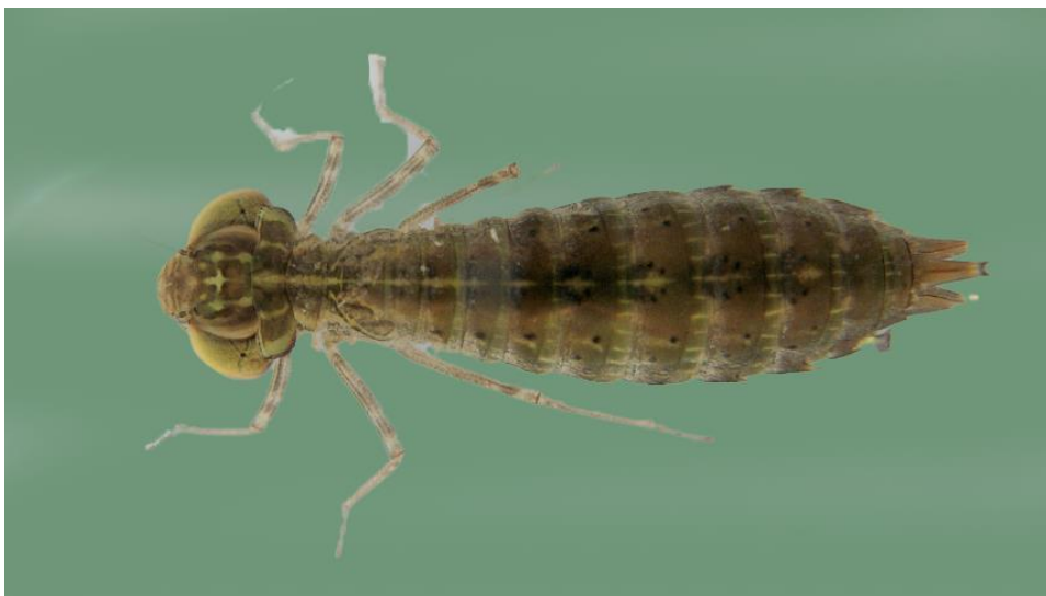
Natural Dragonfly Nymph

I gave this pattern a try recently out on Crane Prairie Reservoir and was very pleased with the results. The design of this pattern allows it to sink slowly and can be fished in shallow waters on a floating or on a hover line. For deeper waters, shorten up the leader and cast with a type 3 sinking line. I like to retrieve this fly with short wonky strips, or longer pulls, spaced with plenty of pauses in between strips. The natural dragonfly nymph moves with short burst as it swims and seeks out prey in smaller aquatic insects. Trout can't resist this large meal!