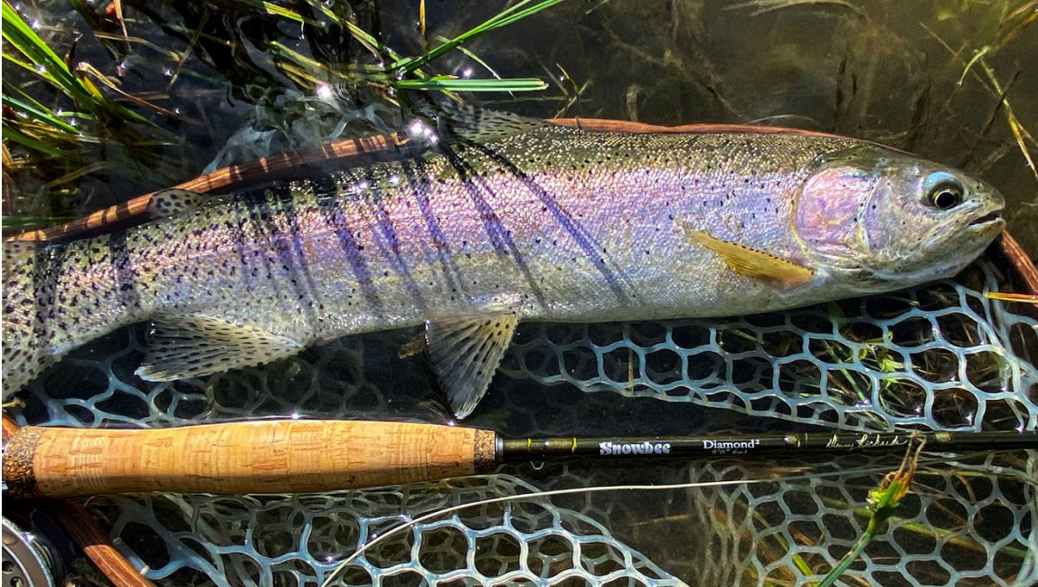
A nice 20-inch Rainbow and Denny Rickards Signature Rod.

Nymph patterns to go with the new rod. We had a great damsel hatch that day and damsel nymphs were climbing up the anchor rope and hatching by the dozens. There were big swirls as trout hungrily feasted on the emerging damsel nymphs. On one of my first casts, a nice 20-inch rainbow took the stillwater nymph pattern and put the rod to the test. It passed with flying colors with this nice fish to net!