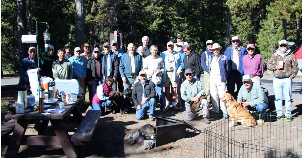
The Sunriver Anglers and Guests!