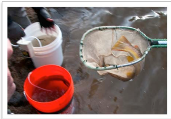
A large Brown in the net