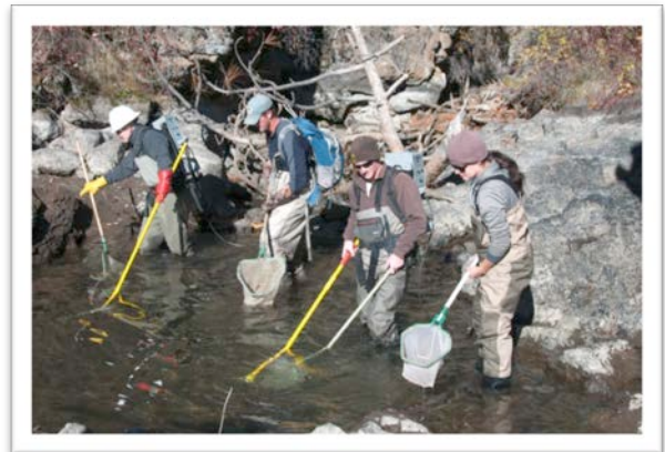
Electroshocking the final pool of the day