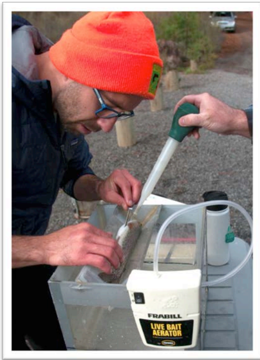
Performing surgery on a mature Redband to place a radio tag