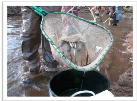
Juvenile Redband rainbow trout being transferred from the net to a bucket