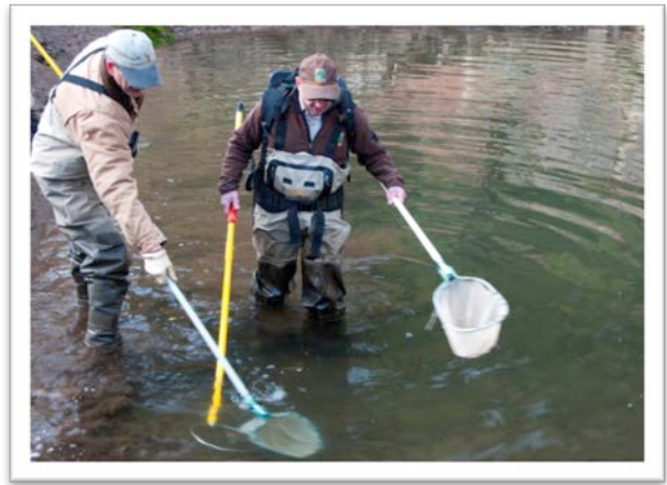
ODFW Shocking and netting fish for transfer back to the main river