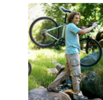
Sunriver visitor loses way on bike path. See page 4.