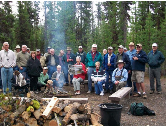
The gang waiting for dinner to cook and be served.