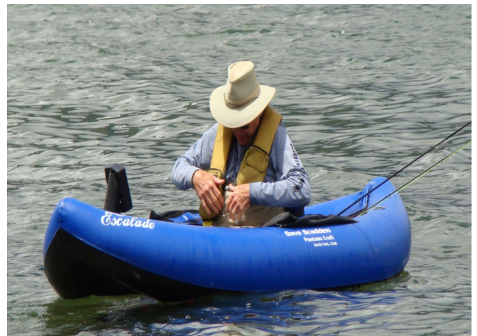
That dang fish went down my shirt. Where the heck is he?