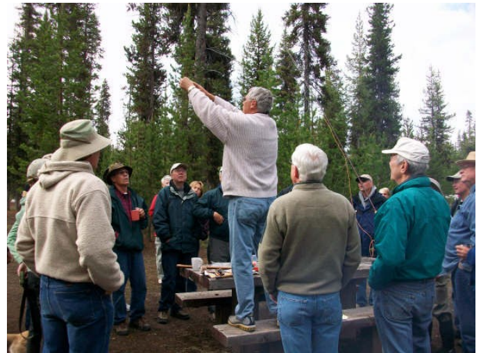
Please Lord, let at least one of us catch a fish today.