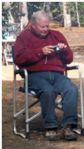
My old 1950 Brownie Hawkeye took better pictures than this thing.