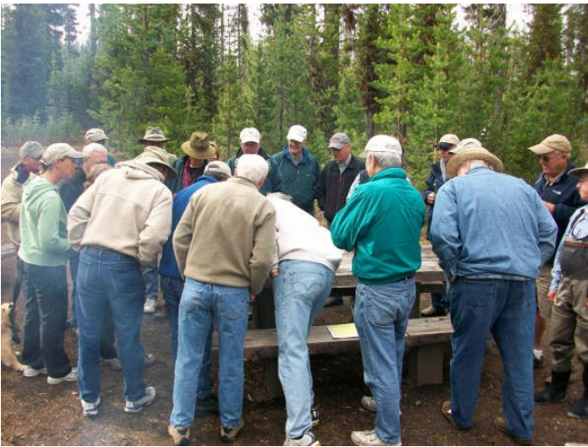
After a long wait, the dice finally started to roll.